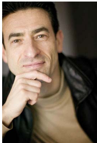
The Philharmonic Orchestra of Monte-Carlo

Every month we keep you informed on the new cultural events and special exhibitions held in Monaco.